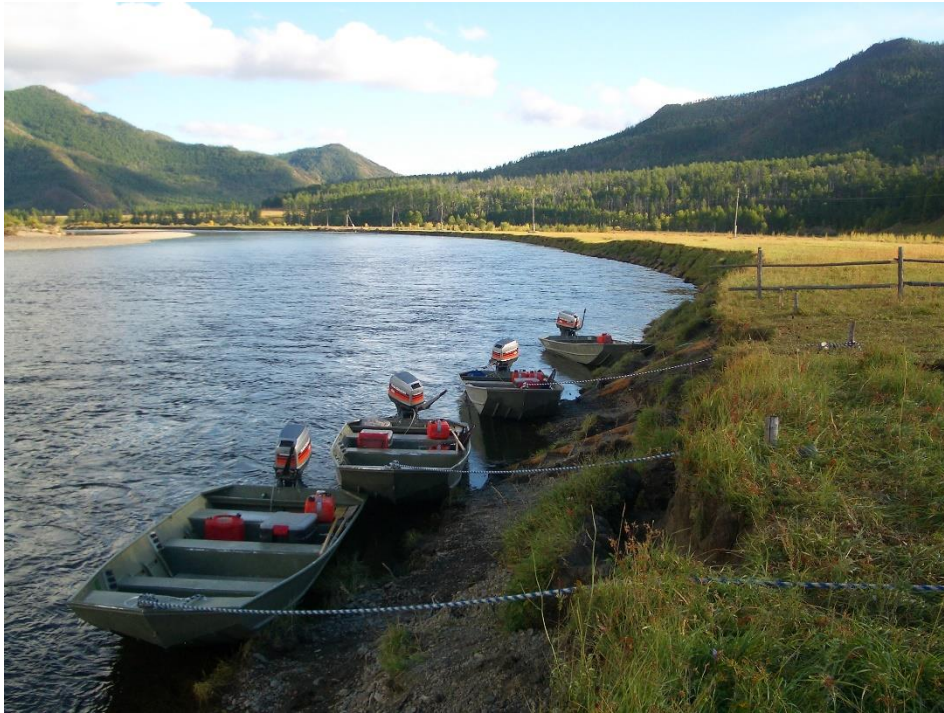
Boats we are using