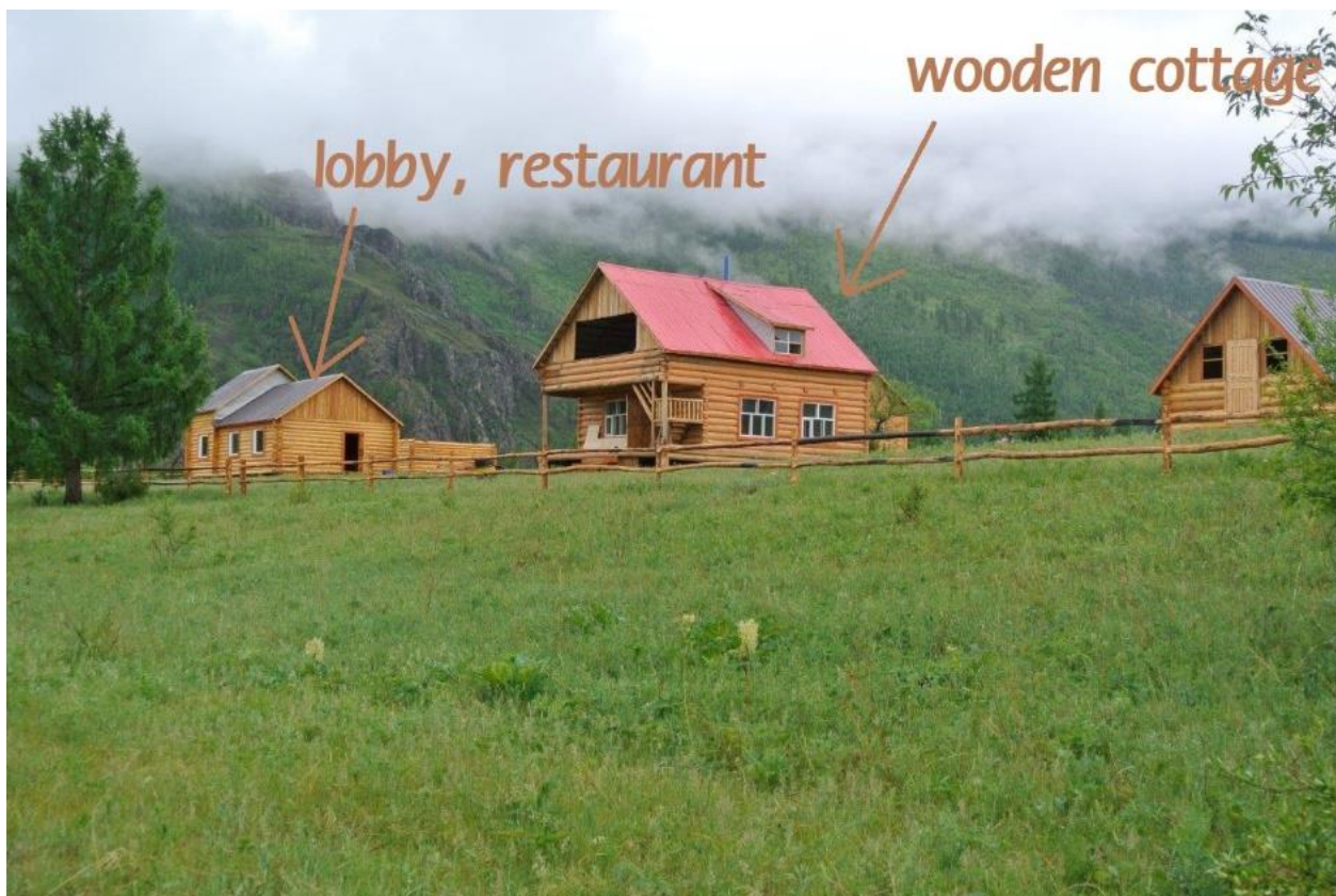
Emt Fishing Lodge

Excluded transportation between Ulaanbaatar and Fishing camp, any other extra services and alcoholic drinks.