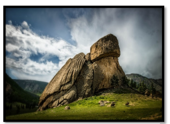
Turtle Rock 1

80 km north-east of Ulaanbaatar (UB) is <u>Gorkhi-Terelj National Park</u>. Gorkhi-Terelj National Park is the most popular destination as well as the third biggest protected area in Mongolia. At 1600 meters the alpine scenery is magnificent. The park is well known for its fascinating rock formations including the most famous formations <u>Turtle Rock</u> and the Old Man Riding a Book. The park offers other adventurous opportunities including hiking, rock climbing, rafting, horse riding or for the more adventurous, swimming in icy waters.